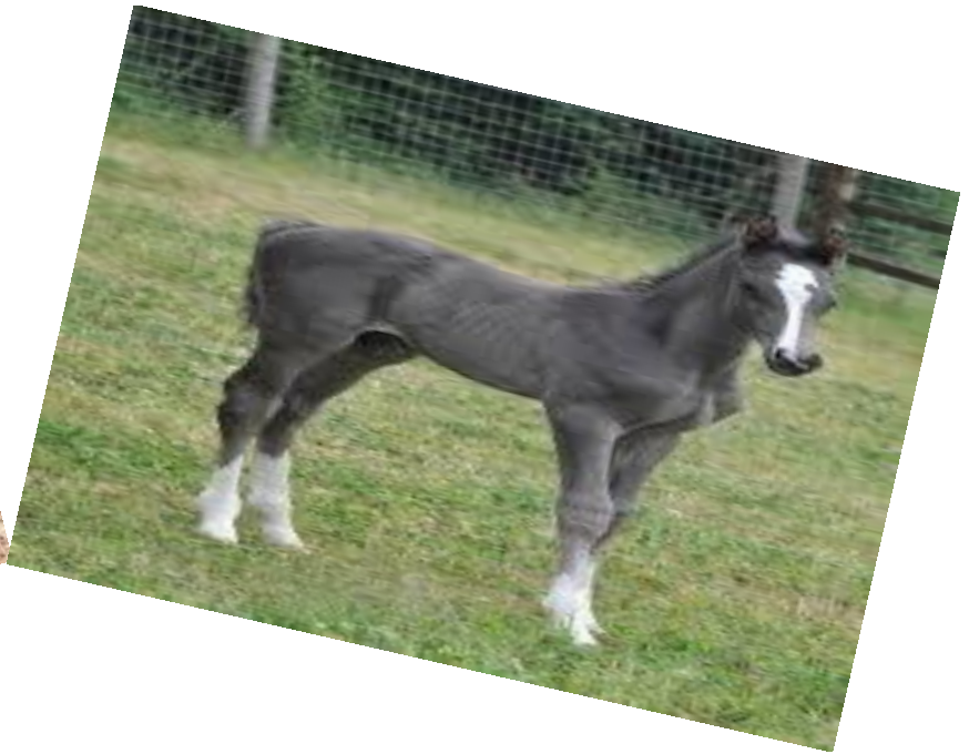
Stockton Junior High Stallions