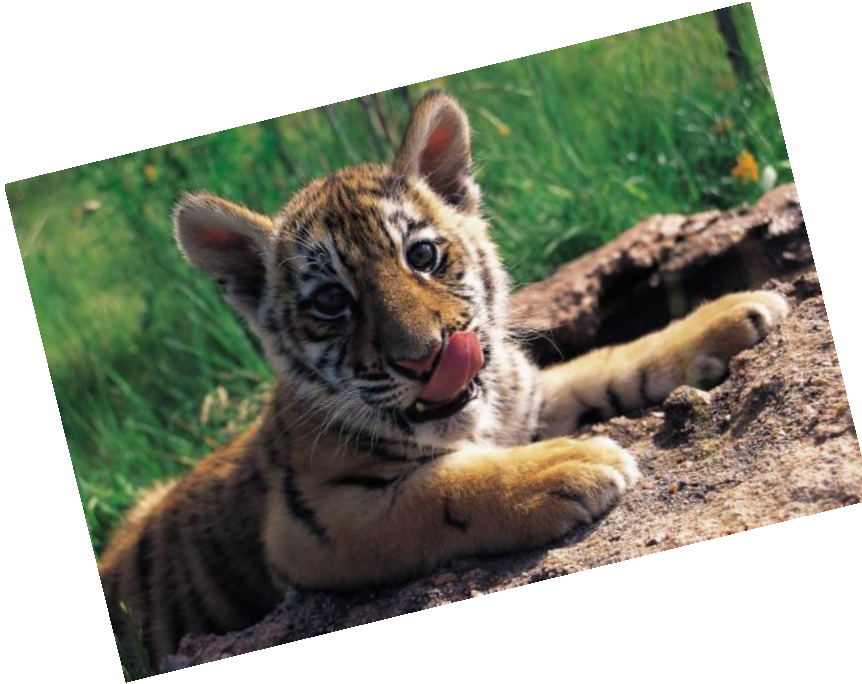
Peet Junior High Cubs